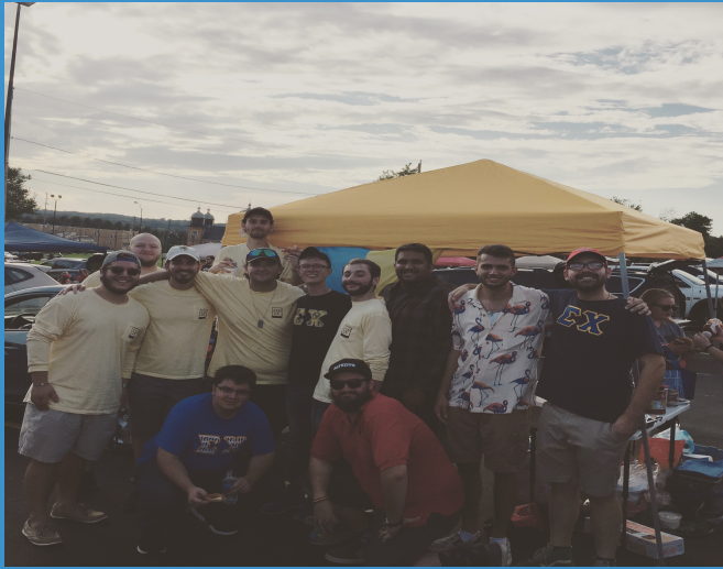
Sigma Chi Homecoming 2018